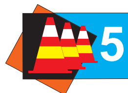
Road Cones and Cylinders