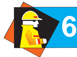
High Visibility Clothing