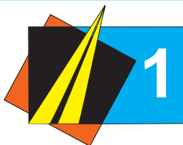
Horizontal Road Markings